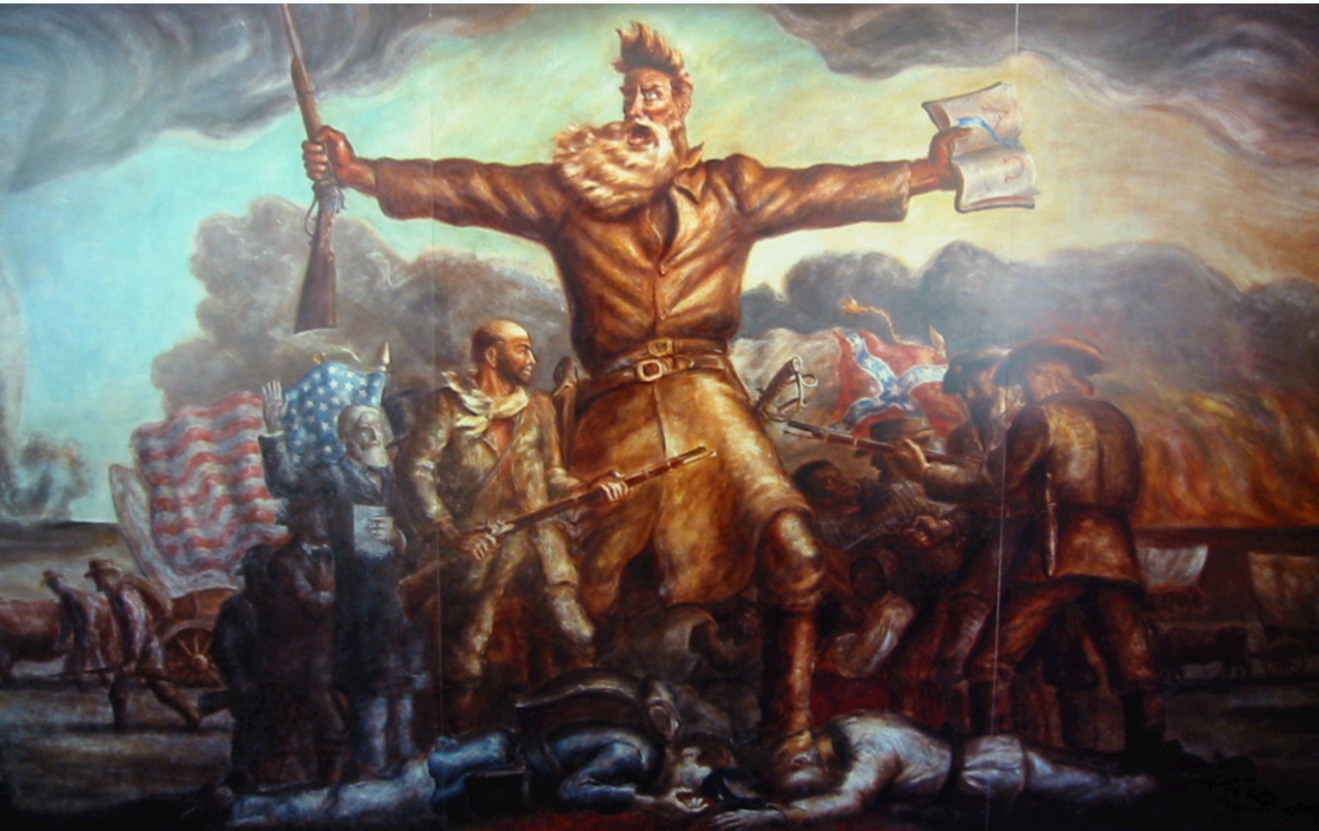
Kansas Leadership from Brown to Brown